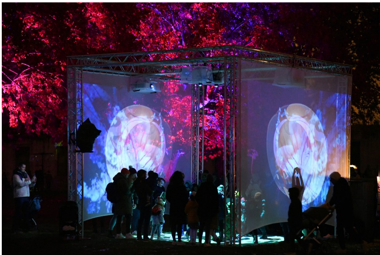
Cachés dans la ville - Théoriz Parc Blandan - 2022