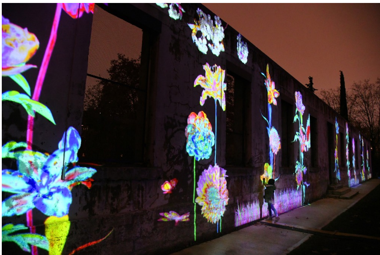
Cachés dans la ville — Théoriz Parc Blandan - 2022