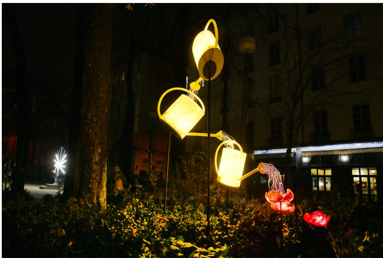
Expérimentations étudiantes - Les Grands Ateliers Place Sathonay - 2022