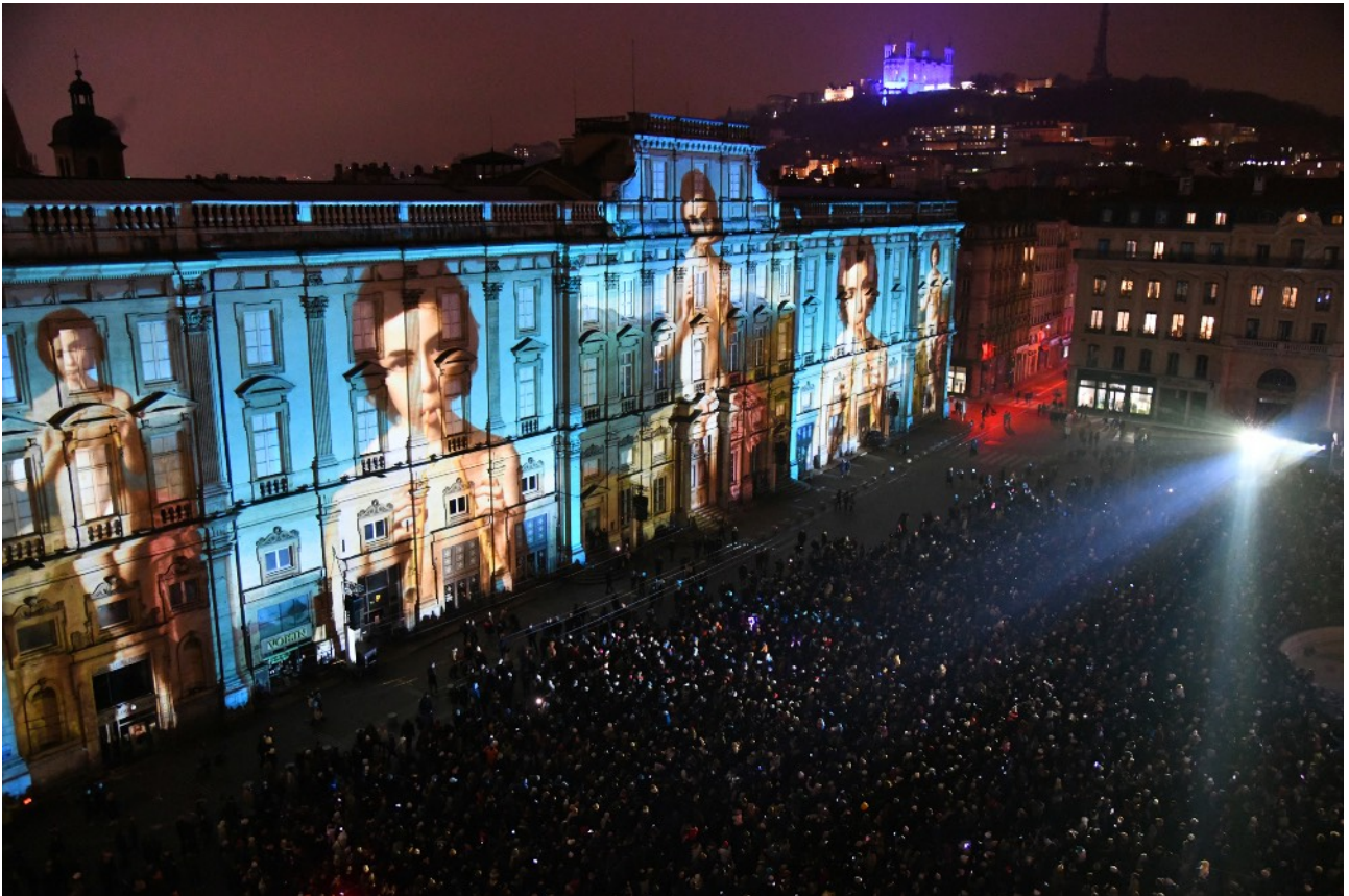
Grand mix au Musée des Beaux-Arts — INOOK Place des Terreaux - 2022