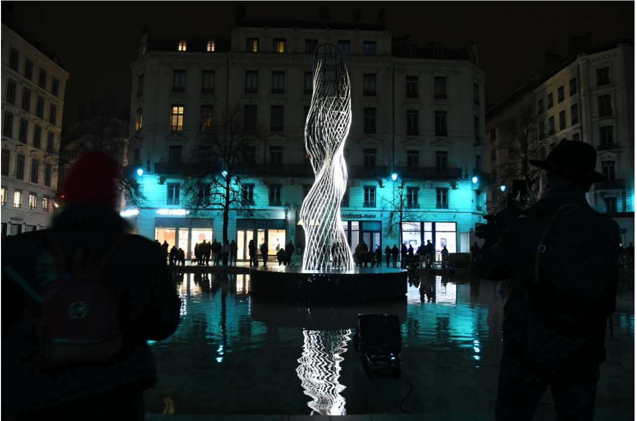
Cymopolée - Luminariste Place de la République - 2022 ©Muriel Chaulet